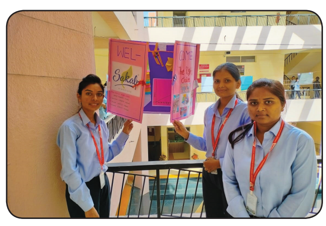
Poster Designing Competition on the theme 'Unorganized Startup to Organized Brand' for MBA-I & II students