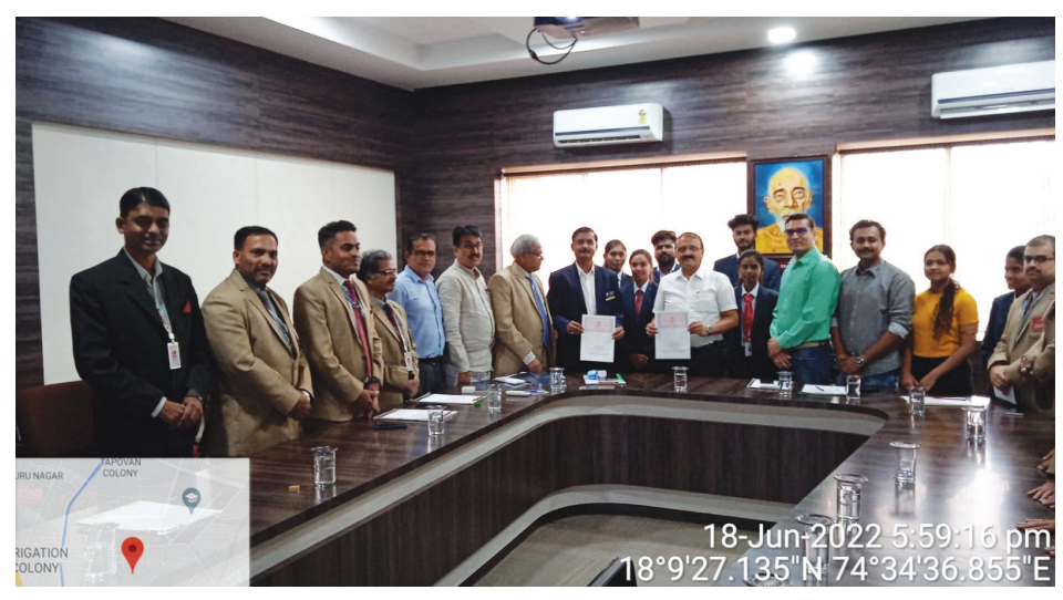
MoU between AIMS and Rotary club Baramati for Cooperation and enhancement in the field of social work and community services