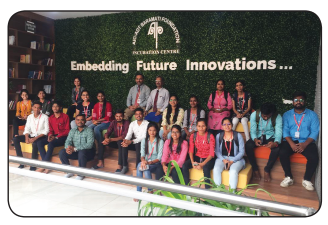
Visit of MBA students to Atal Incubation Centre, Baramati (2022)