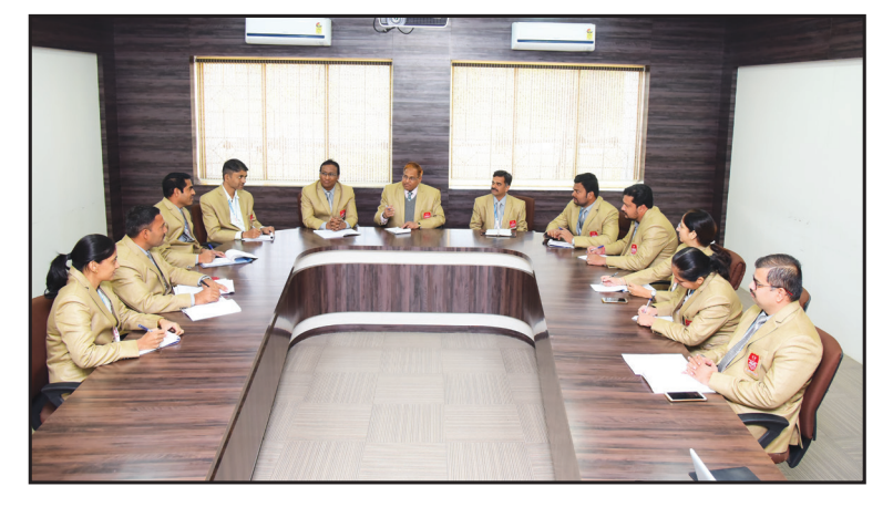
Entrepreneurship Development & Placement Cell

AIMS offer separate boarding and lodging facilities for boys and girls and to the visitors. The students are provided spacious furnished accommodation. Separate boys and girls hostels are facilitated with 60 rooms each, excellent kitchens, dining hall, hot water and Aquaguard facility, TV Hall with projector.