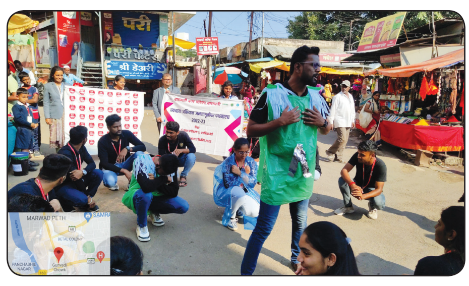
Street Play on Solid Waste Segregation in association with Baramati Municipal Council