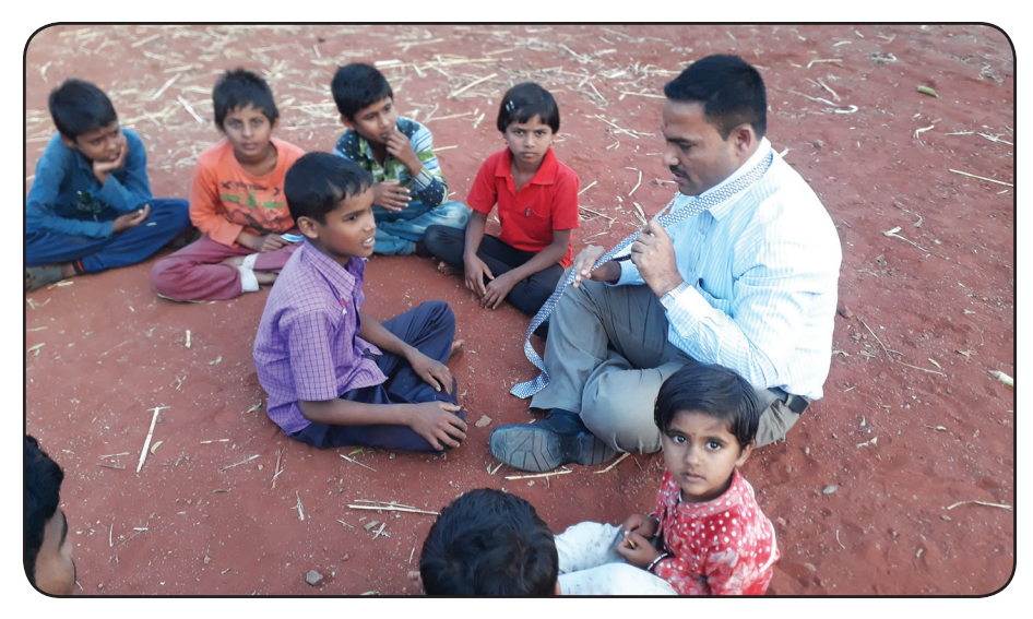
Recreational Activities for children of migrant sugarcane cutters in Someshwar Sugar Factory