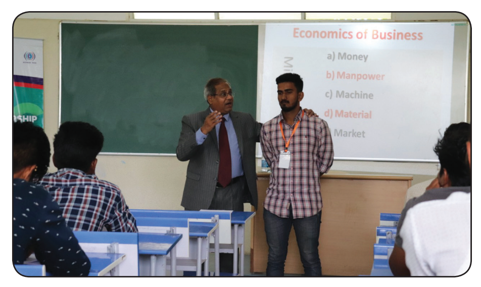
One Day Skill Development Workshops at UG Colleges in the Baramati Vicinity