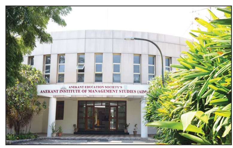
AIMS Main Building

The blooming technology has taken deep roots in every field now days. It is impossible for anyone to imagine a world without high computing environment. In the management field, I.T. plays a vital role directly or indirectly. In order to meet the challenges of modern learning and to keep abreast with the global scenario, the campus is Wi-Fi enabled. The Institute is equipped with state-of-the-art computing facility. All the students have free access to the Computer Labs to do their work anytime of the day. The high speed internet connectivity provides an extended access to vast intellectual resources.