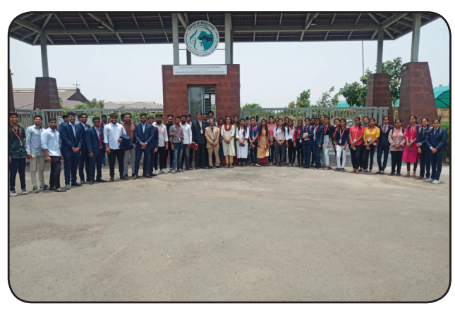
Visit to Centre of Excellence Dairy, Baramati (2022)