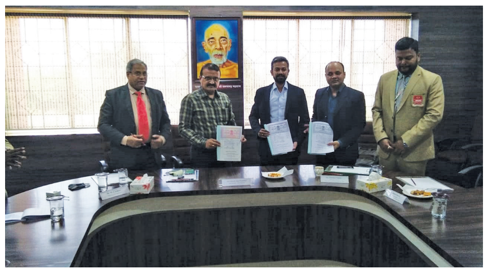
MoU between AIMS Baramati and NextGen, Pune for association in the field of SAP training