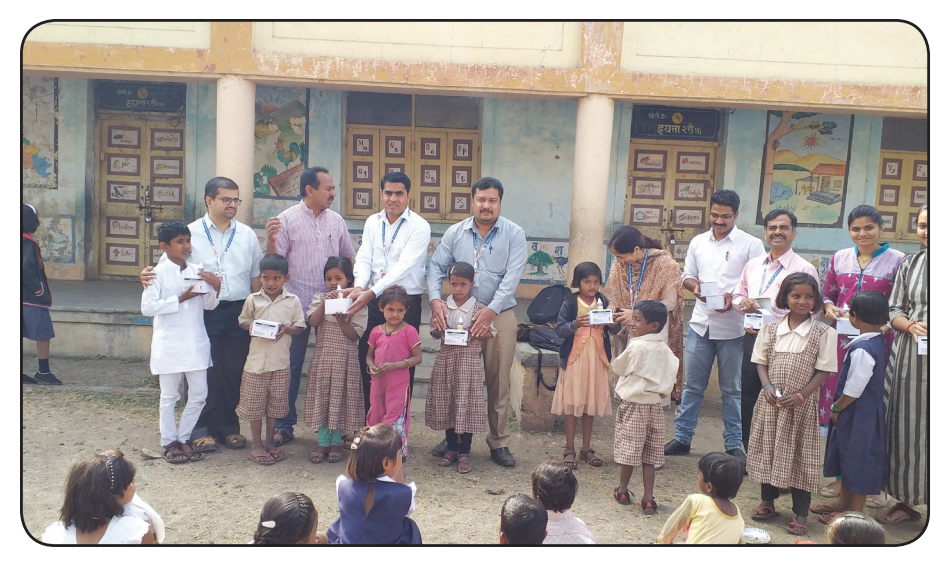
Distribution of Chlorine Bottles for water purification to children of migrant sugarcane cutters in Someshwar Sugar Factory