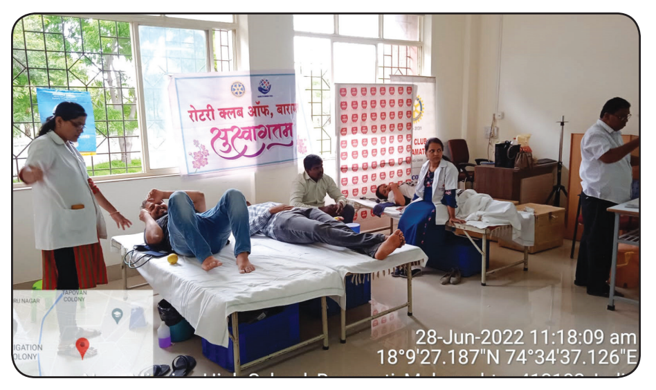
Blood Donation Camp in association with Rotary Club Baramati