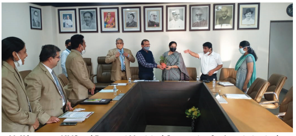
MoU between AIMS and Baramati Municipal Corporation for Association in the field of Management Student centric Socioeconomic Services